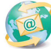
Sage E-marketing for Sage CRM

info.pacific@sage.com www.sagebusiness.com.au | www.sagebusiness.co.nz Call 13 sage (Australia) | 0800 904 409 (New Zealand)